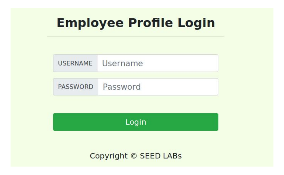
Figure 1: The Login page

We will use the login page from www.seed-server.com for this task. The login page is shown in Figure 1. It asks users to provide a user name and a password. The web application authenticate users based on these two pieces of data, so only employees who know their passwords are allowed to log in. Your job, as an attacker, is to log into the web application without knowing any employee's credential.